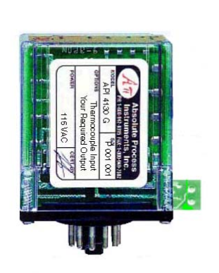
\frac{API\ 4130\ G\ L}{Thermocouple\ to\ DC\ Isolated\ Transmitter}

Solution: API modified a standard API 4130 G L units to remove the burn-out detection circuitry so there is no conflict with the burn-out detection current from the chart recorder. The API application engineering representative also recommended the customer get the EXTSUP option as the SLC500 programmable Logic controller (PLC) the customer is using requires a single ended input instead of a differential input.